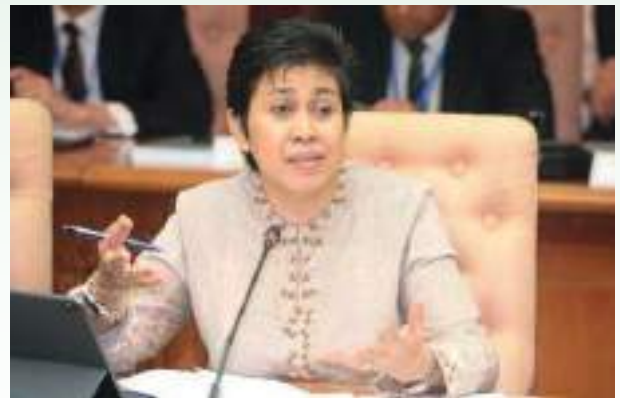
Bank Negara Governor Datuk Nor Shamsiah Mohd Yunus said the growth would be reinforced by the recovery in domestic demand.

"One important distinction between MCO 1.0 and MCO 2.0 is that all economic sectors were allowed to operate (during MCO 2.0)," said Nor Shamsiah. - Bernama