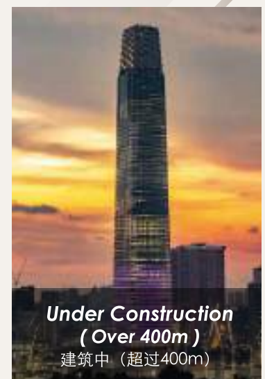
Signature Tower, Malaysia Signature 大厦, 马来西亚