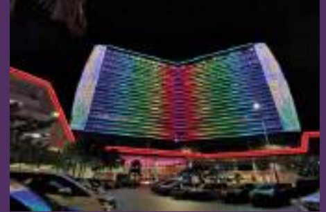
马来西亚大红花 (丽昇精选酒店) 主楼展现崭新风采