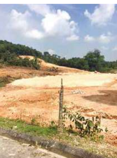
ISSUE 54 page 06