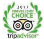
Tripadvisor Award M.A., USA 2017