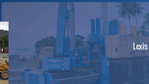
Lexis Suites , Penang