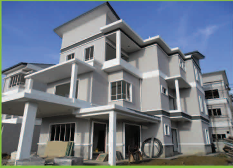
Desa Meringin , Selangor

The project is making fast progress with expected completion date around February 2013, three months ahead of the scheduled completion in May.