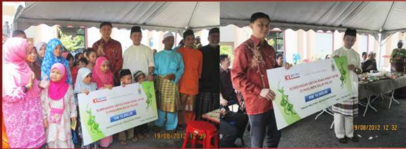
Charitable donation to Orphanage Home during Hari Raya in 2012

The commitment to corporate social responsibility is an important priority to KL Metro Group, its CSR initiatives include funding of charitable activities, promoting education, sport and related programs, helping the needed and underprivileged.