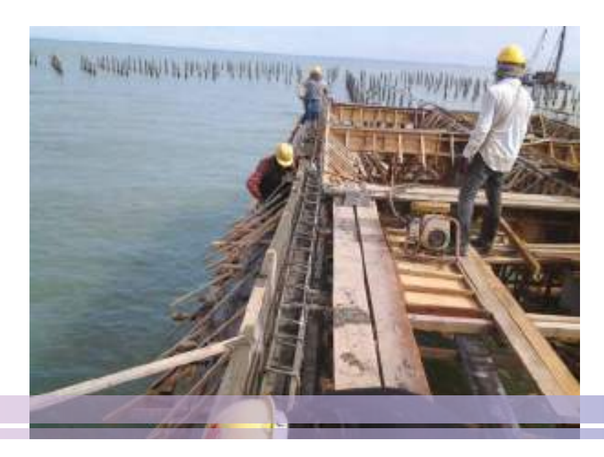
Steady progress at The Hibiscus Port Dickson. Stay tuned for more updates!