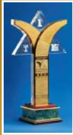
Century International Quality Gold ERA ( Geneva ) 2011