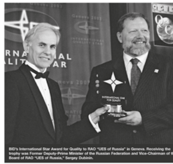
BID's International Star Award for Quality to RAO "UES of Russia" in Geneva. Receiving the trophy was Former Deputy-Prime Minister of the Russian Federation and Vice-Chairman of the Board of RAO "UES of Russia's" Sergey Dubinin.

RAO UES of Russia received the International Star Award for Quality through former Minister of Finance of Russia, Sergey Dubinin