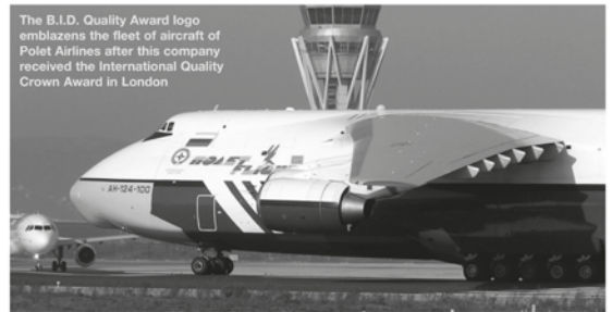
The B.I.D. Quality Award logo emblazons the fleet of aircraft of Polet Airlines after this company received the International Quality Crown Award in London

100 meet the current environmental and safety requirements with flying colors. Company representatives are proud to state that they go above and beyond the requisites listed by the International Aviation Authorities.