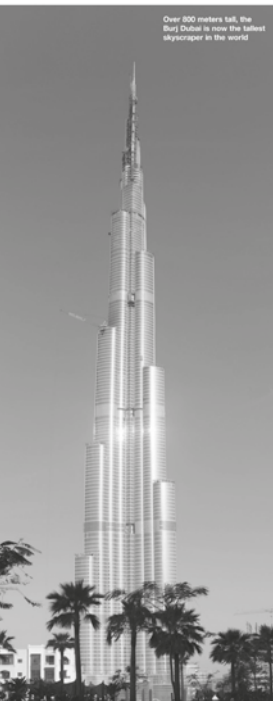
Over 800 meters tall, the Burj Dubai is now the tallest skyscraper in the world

American company has led the construction of many famous buildings, such as the United Nations Secretariat in New York, the United Airlines Terminal 1, the Madison Square Garden, the American Stock Exchange and the Rose Garden Arena. It is not surprising that Turner has been granted prestigious