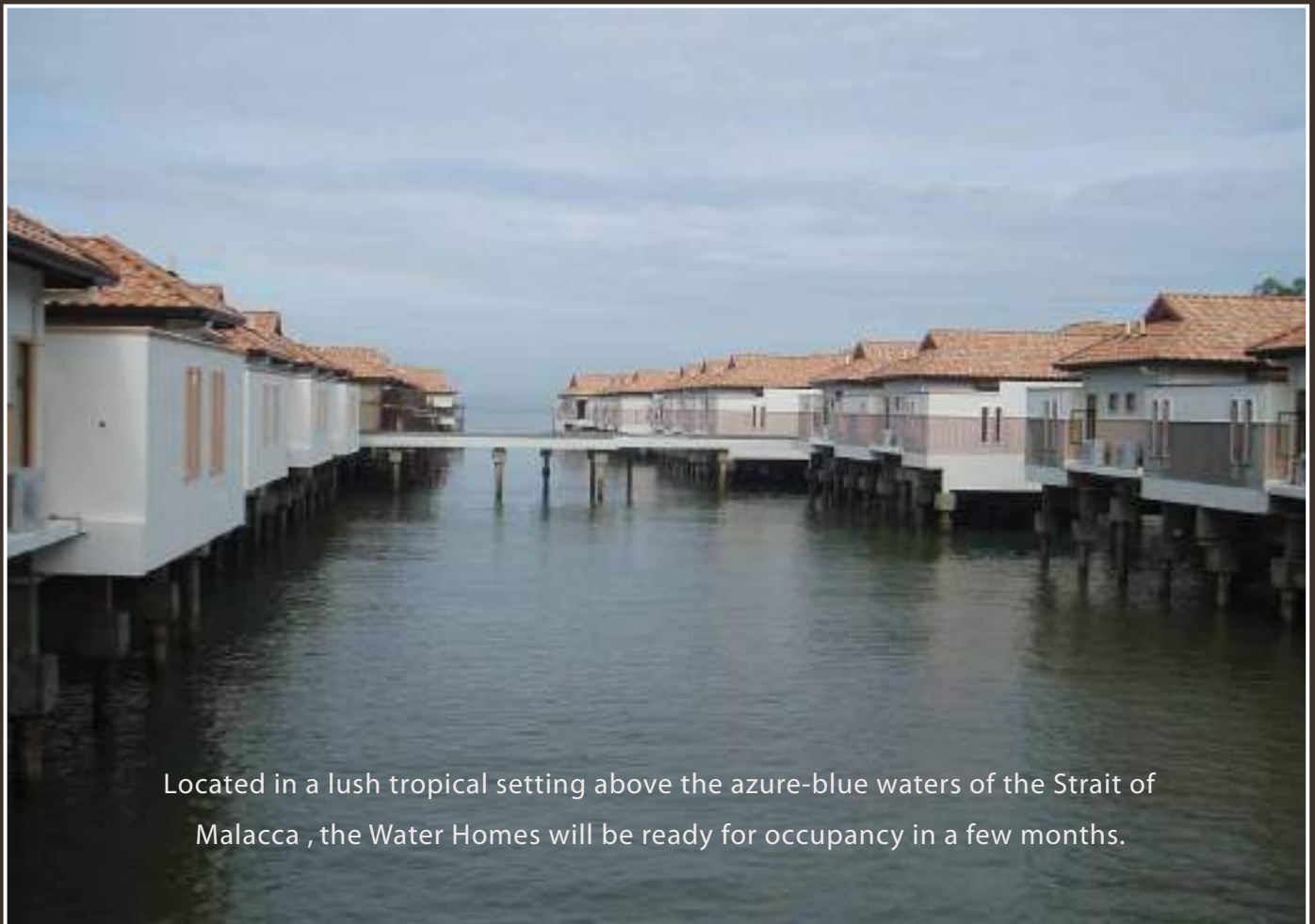
Located in a lush tropical setting above the azure-blue waters of the Strait of Malacca , the Water Homes will be ready for occupancy in a few months.