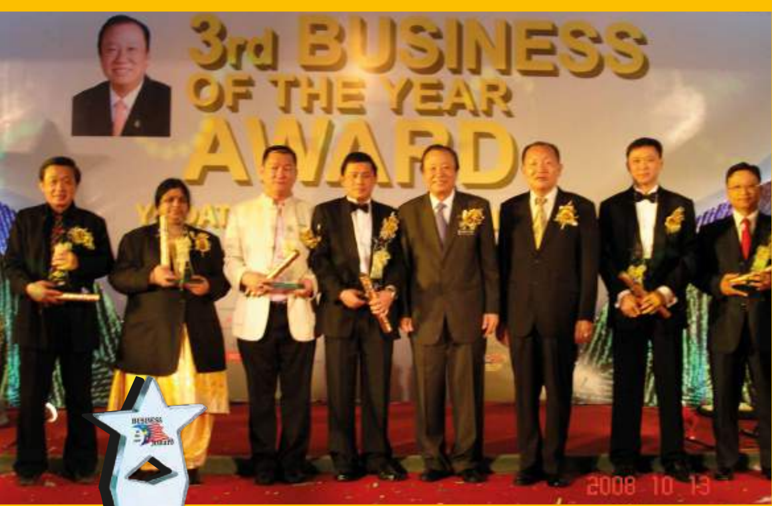
Gala award presentation of the 3rd Malaysia Business of The Year Award on 13th October 2008 at Istana Hotel , Kuala Lumpur

A moment of pride and joy for Kuala Lumpur Metro Group for winning the 3rd Malaysia Business of The Year Award ( Emerging Entrepreneur of the Year 2008 ) , in recognition of its outstanding performance.