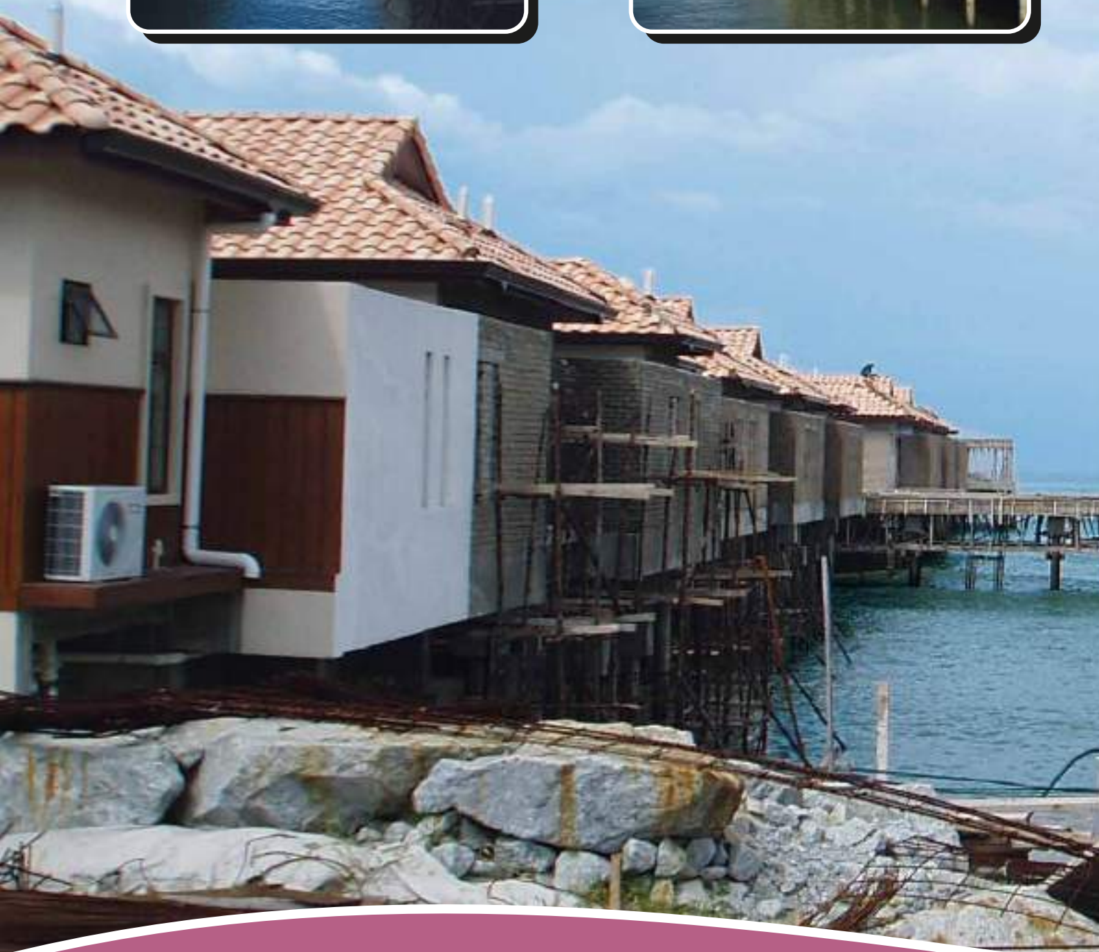
Works on interior finishing are well underway