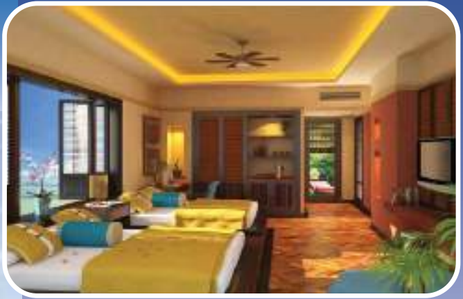
Cosy living area opens to the many splendors of the Straits of Malacca