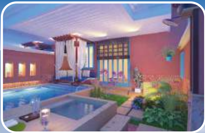
Signature amenities complete with private pool, open-air shower, landscaped indoor garden and sun lounges

Nestled in the historically rich, colorful and awe-inspiring State of Malacca is the latest water homes project of KL Metro Group ~ The Hibiscus. This uniquely designed resort resonating great beauty and peacefulness is set to be the next landmark of Malacca, a work of art that portrays an exquisite and sensual statement.