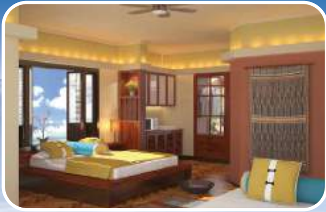
Artistically decorated with quality materials and finishes