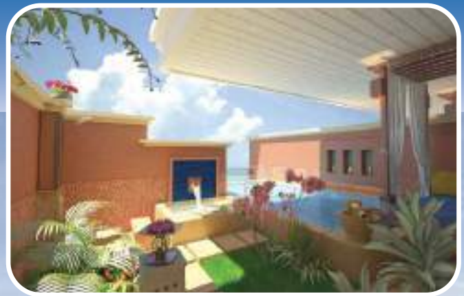
Sophisticated Zen-like design creates a peaceful haven for relaxation and intimacy