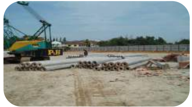
Reclamation works are approaching completion with protective rockbound in place.