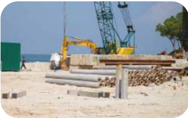
Piling machines and equipments are in position ... ready for action !