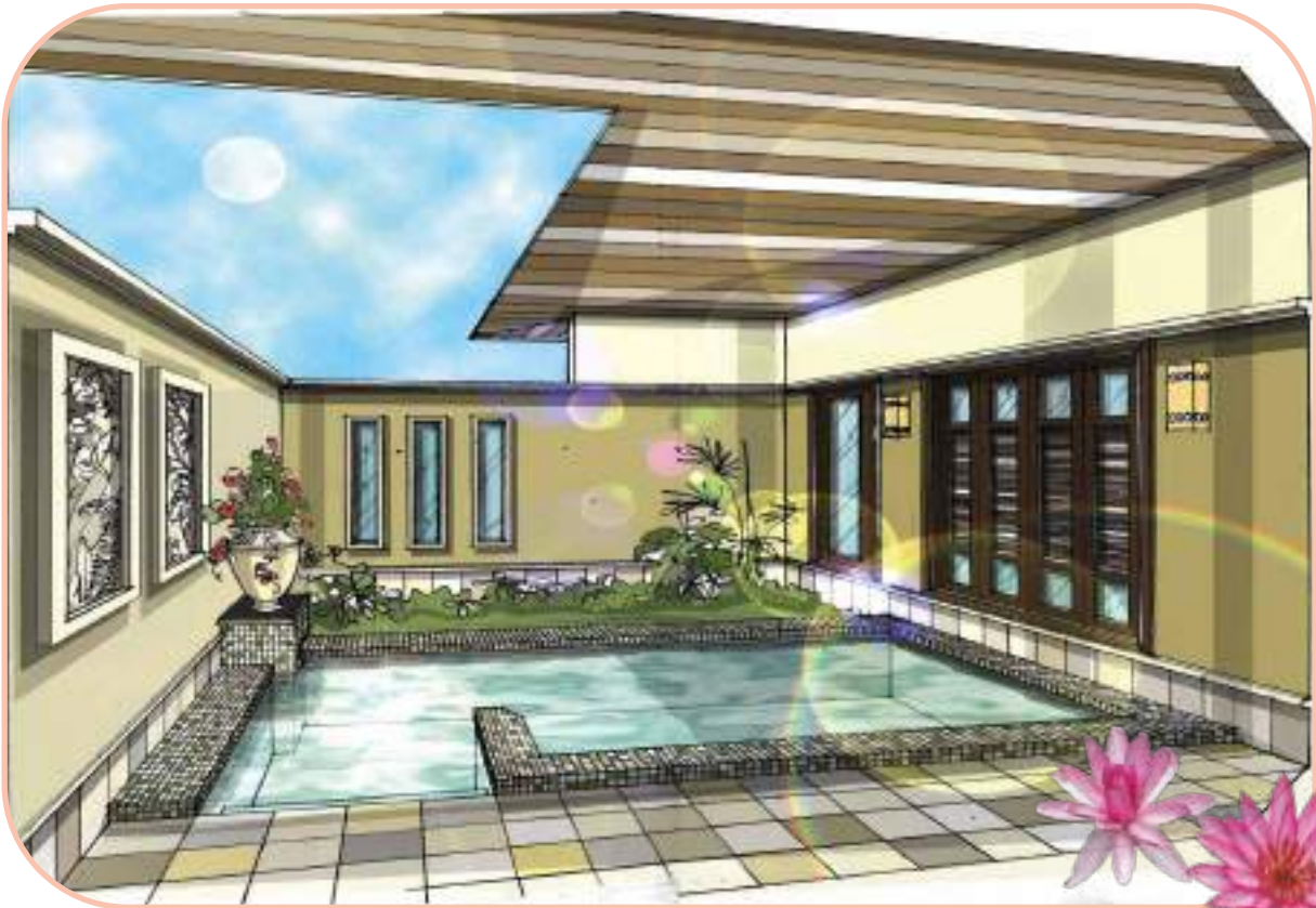
Artist impression of outdoor pool & open air garden.

Units for Type A will be opened for sale in early 2007. The agents will be informed on the sale price in due course.