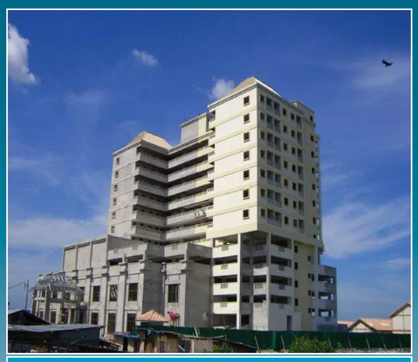
Project completion for service suites is at the end of May 2006