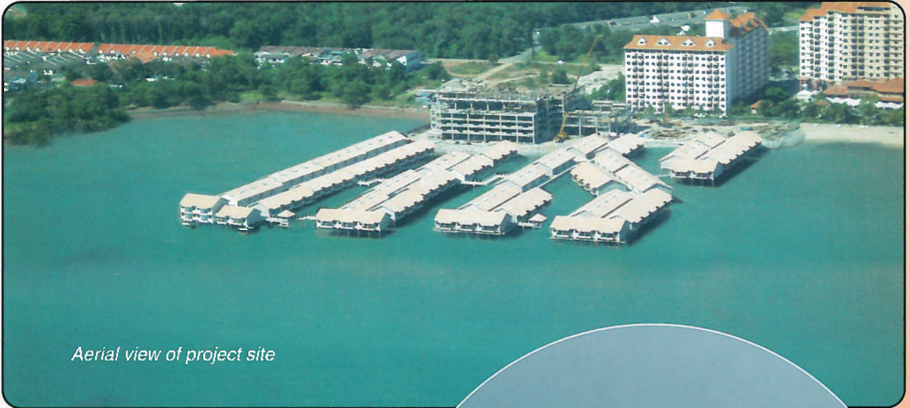
Aerial view of project site