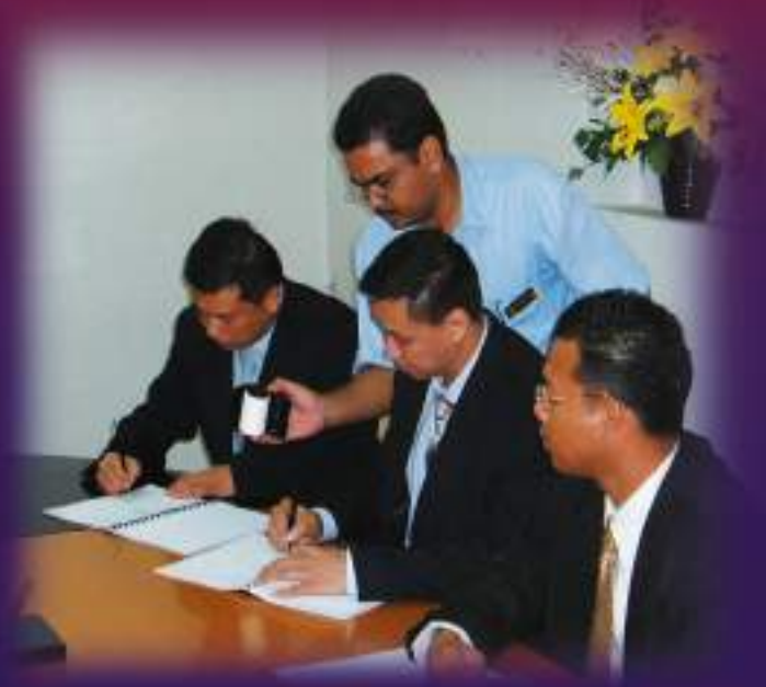
Signing of agreement with the state government of Melaka at the office of Jabatan Ketua Menteri Melaka on 16th February 2005