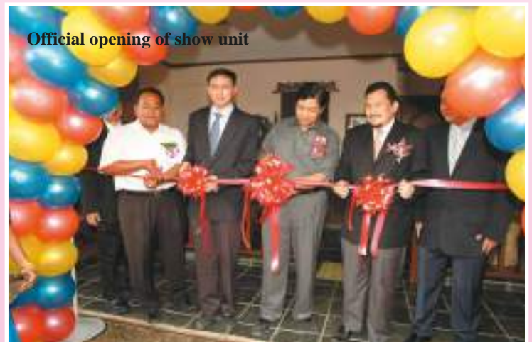
Official opening of show unit