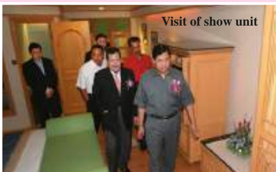
Visit of show unit