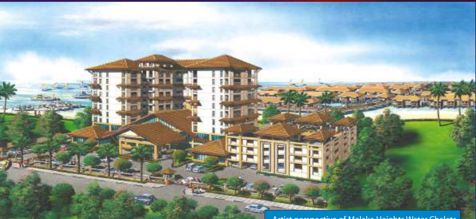
Artist perspective of Melaka Heights Water Chalets