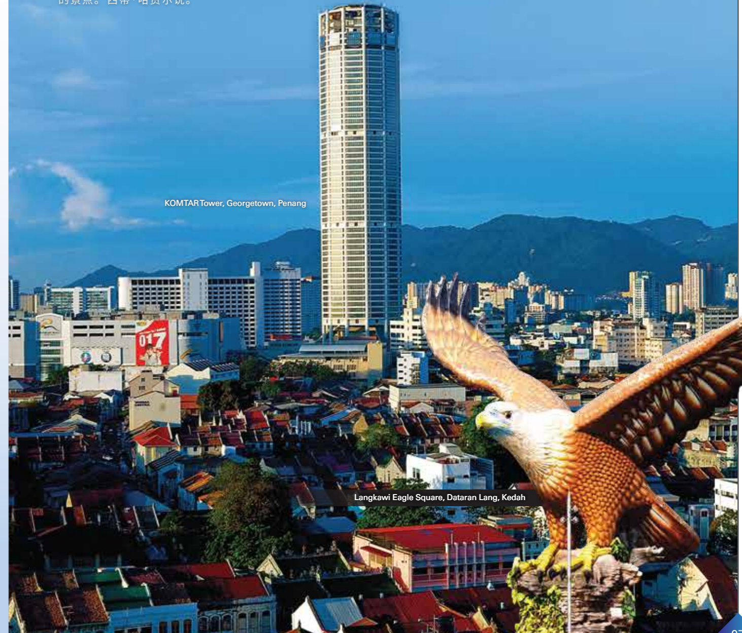
Langkawi Eagle Square, Dataran Lang, Kedah