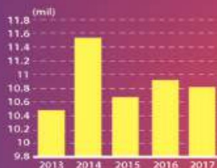
Tourist arrivals (Jan-May)

To put things into perspective, the tourist arrivals so far is also lower by 0.61% than the five-year average of tourist arrivals in the first five months of the year. Another data to ponder is that while overall visitors from Asean countries to Malaysia have increased by 0.62% to 8.22 million visitors in January to May, five